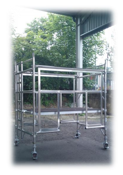
Platform levels of: