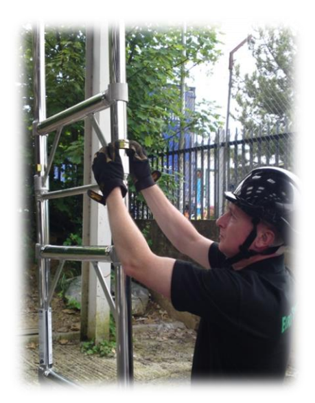
5. Engage Interlock Clips.