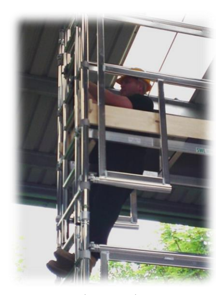
Access and egress to the next platform level through the trapdoor, using the ladder provided.