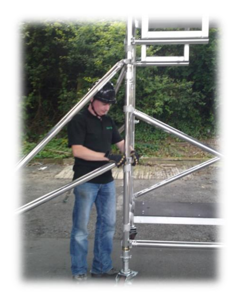
9. Secure stabilizers as soon as possible to increase tower stability.