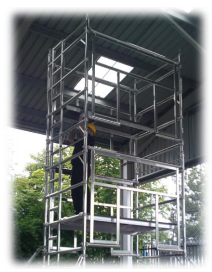
14. Remove the temporary trapdoor platform Position to the appropriate rung (Trapdoor facing the ladder section) 1 rung above the bottom section of the AGR frames.