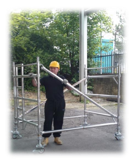
3. Add 2 diagonal braces, from the 1st to 3rd rung as shown.