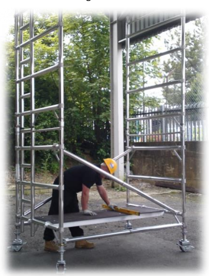
6. Fit temporary platform to the 1<sup>st</sup> rung and level base.