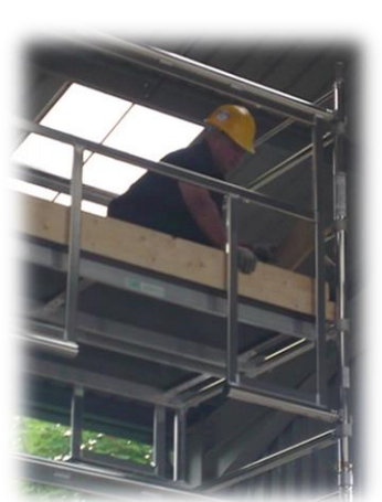
16. Fit toeboards in the correct position.