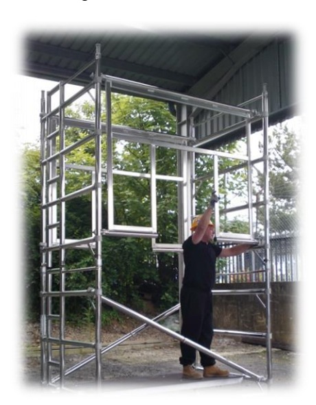
7. Standing on the platform, with the green label facing you, position the 1<sup>st</sup> pair of AGR frames to the vertical members above the rungs in the required position as shown.