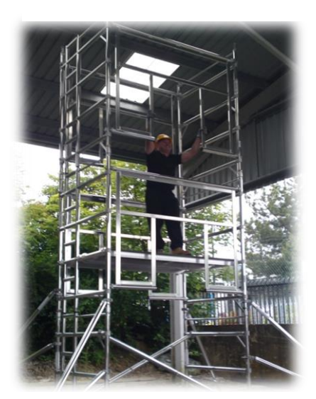
13. With the green label facing you, position the AGR frames to the vertical members, above the rungs in the required position as shown.