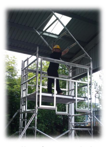
11. Add 4 rung frames, ensuring that the ladder is continuous.