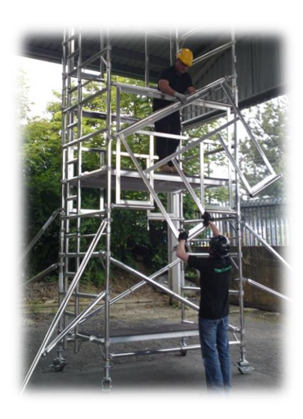
12. Safely pass up the next set of AGR frames as shown.