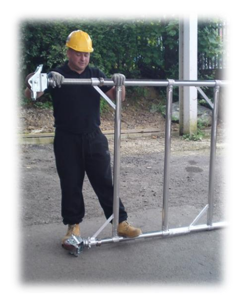
1. Insert 2 legs and castors into each frame.