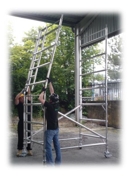
4. Add next level frames – according to your kit list.