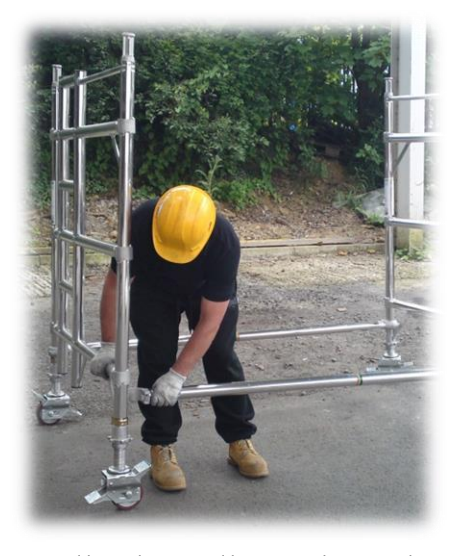
2. Klik in 2 horizontal braces to the vertical member of the frames, as low as possible, below the 1st rung.