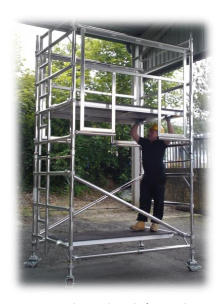
8. Position the trapdoor platform to the appropriate rung (Trapdoor facing the ladder section) 1 rung above the bottom section of the AGR frames.