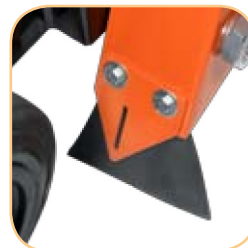
Rear cutting guide.