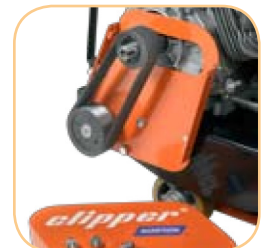
Pulleys with removable hub and Poly V belts.