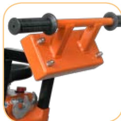
Handlebar equipped with vibration absorbers.