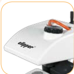
Easy removal of water tank.